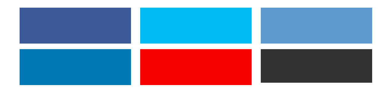
By Bobby Duffy From The Conversation

The reasons why are hardwired into our animal instincts – and fuelled by some unconscious biases.